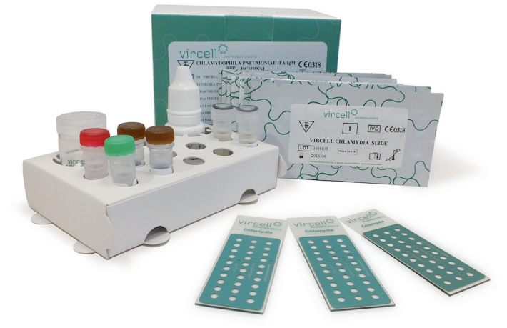
Ref. PCHPNM 100 Tests