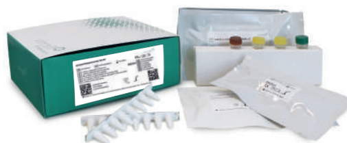
Ref. RTPCR0016-LP, 24 tests