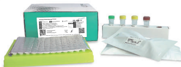
Ref. RTPCR016-LPD, 96 tests