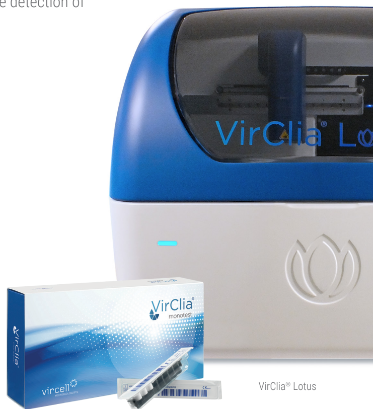
VirClia® MONOTEST - 24 tests