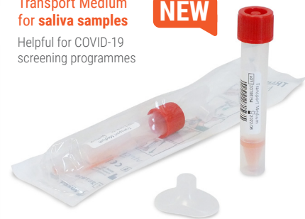
Transport Medium-2 Ref. TM015

Helpful for COVID-19 screening programmes