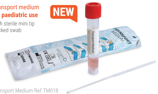
Transport Medium Ref. TM018